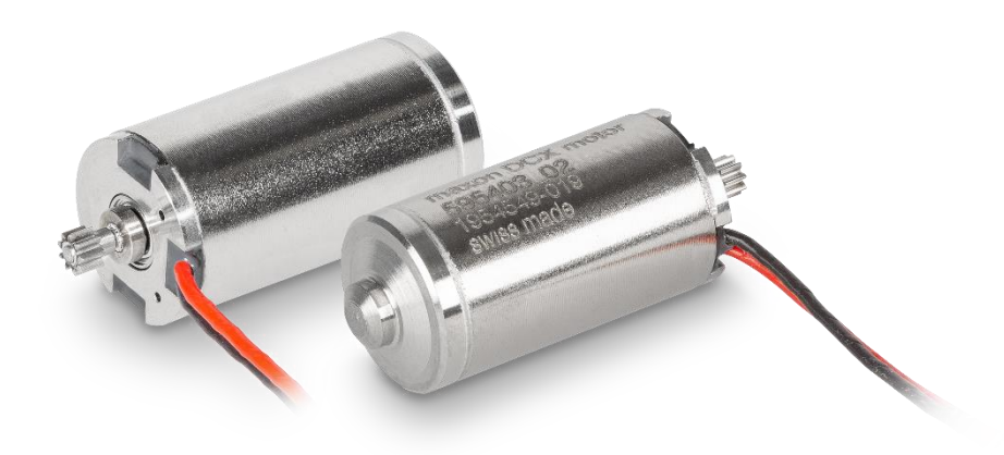
The Flight Model DCX 10 S for control of the Mars Helicopter swashplate.